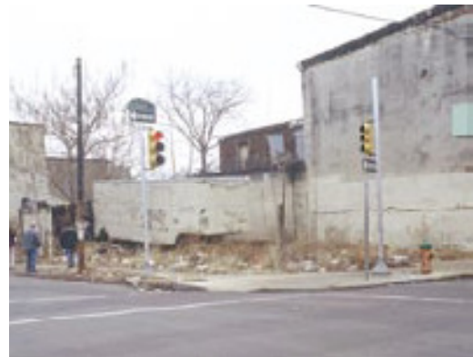
Vacant lot in Philadelphia before and after clean and green. 1

Clean and Green prioritizes strategically located properties – those that serve as 'gateways' to a neighborhood or are