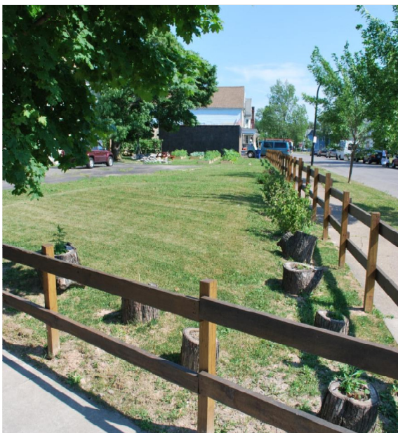
Lot cleaned and greened by PUSH Buffalo at 608 West Utica Street, Buffalo

These wasted spaces generate little or no tax revenue, and are a major source of blight. Uncared-for properties are a target for illegal dumping, crime, and drug use. They are eyesores, and they can drastically lower the property values of surrounding homes. 5