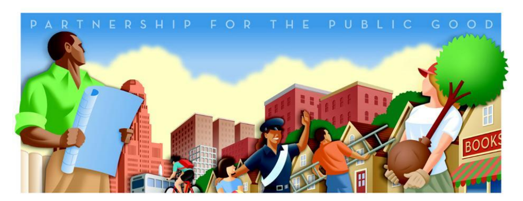
Partnership for the Public Good <u>www.ppgbuffalo.org</u> 237 Main St., Suite 1200, Buffalo NY 14203