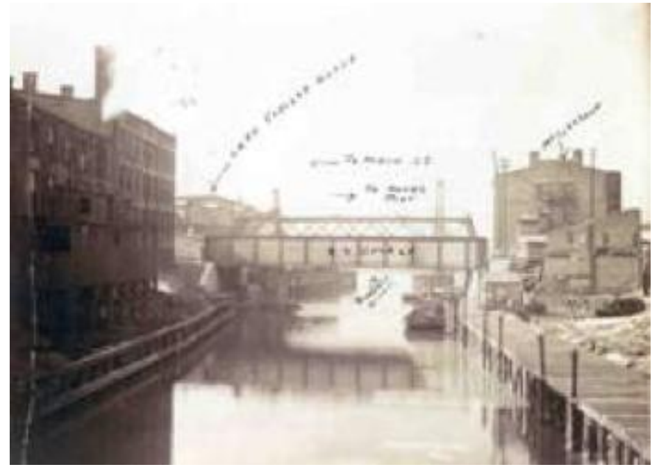
The Canal Harbor